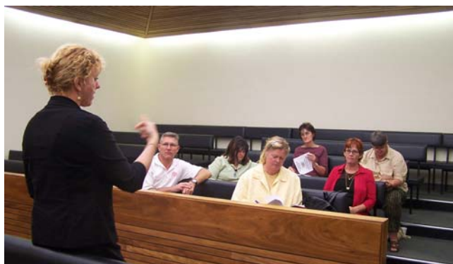
Volunteer training session at Wollongong Court

Two training sessions later with the Wollongong Police, and over 220 officers in the South have now been trained about the rights of people with an intellectual disability, and about the CJSN service. It won't be long before all the officers in the Wollongong Local Area Command have been trained by CJSN, and special thanks go to Kylie MacFarlane, EDO at Wollongong Police Station for facilitating and supporting the training and CJSN presence in the Police station.