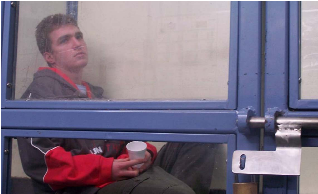
A scene from the Getting Arrested – What to Do video/DVD